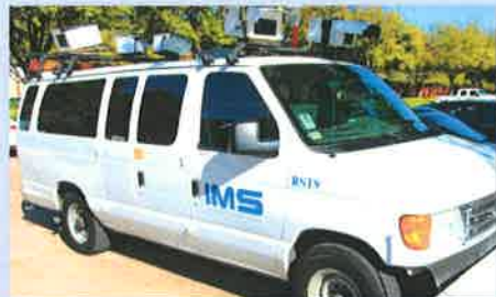
This specially-equipped truck used state of the art GPS technology, video cameras and lasers to evaluate surface streets in Farmers Branch.

Early voting will take place Monday through Saturday, April 28 through May 3 from 8 a.m. until 5 p.m. Sunday, May 4 from 1 until 6